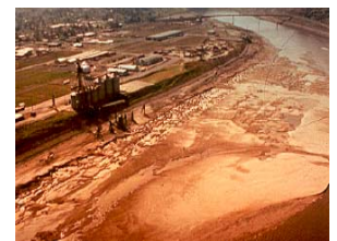
Port of Clarkston impact from the 1992 Snake River drawdown test.

In 1992, the Corps of Engineers conducted a drawdown test of the Lower Granite Reservoir on the Snake River below Lewiston. It killed fish; it destroyed property; it eliminated hydropower production at Lower Granite Dam; it ended navigation to the Ports of Clarkston and Wilma, Washington and Lewiston, Idaho.