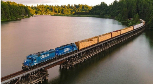
Coos Bay Rail Line

Increase the passenger facility charge (PFC). Increasing the PFC will help offset the cost of building and modernizing airport infrastructure, and support improvements to aviation facilities, technology and equipment. This will allow airports to better meet current air traffic demands and prepare for the future needs of the nation's aviation transportation network.